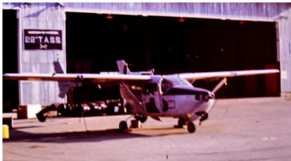
Skymaster (O-2A) assigned to 22nd Tactical Air Support Squadron (TASS) at Binh Thuy, Vietnam

The Forward Air Controllers Association membership includes servicemembers of organizations that were part of the 504th Group headquartered at Binh Hoa Air Base during the Vietnam war.